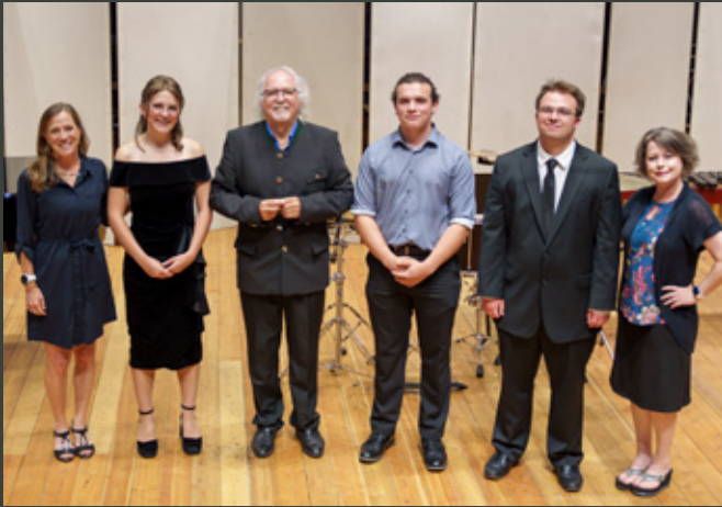
2024 Scholarship winners

Each year, the Donald Runnicles Musical Arts Scholarship Competition awards $50,000 in scholarships to three high school seniors from Wyoming, Montana, or Idaho to pursue the study of music at the collegiate level.