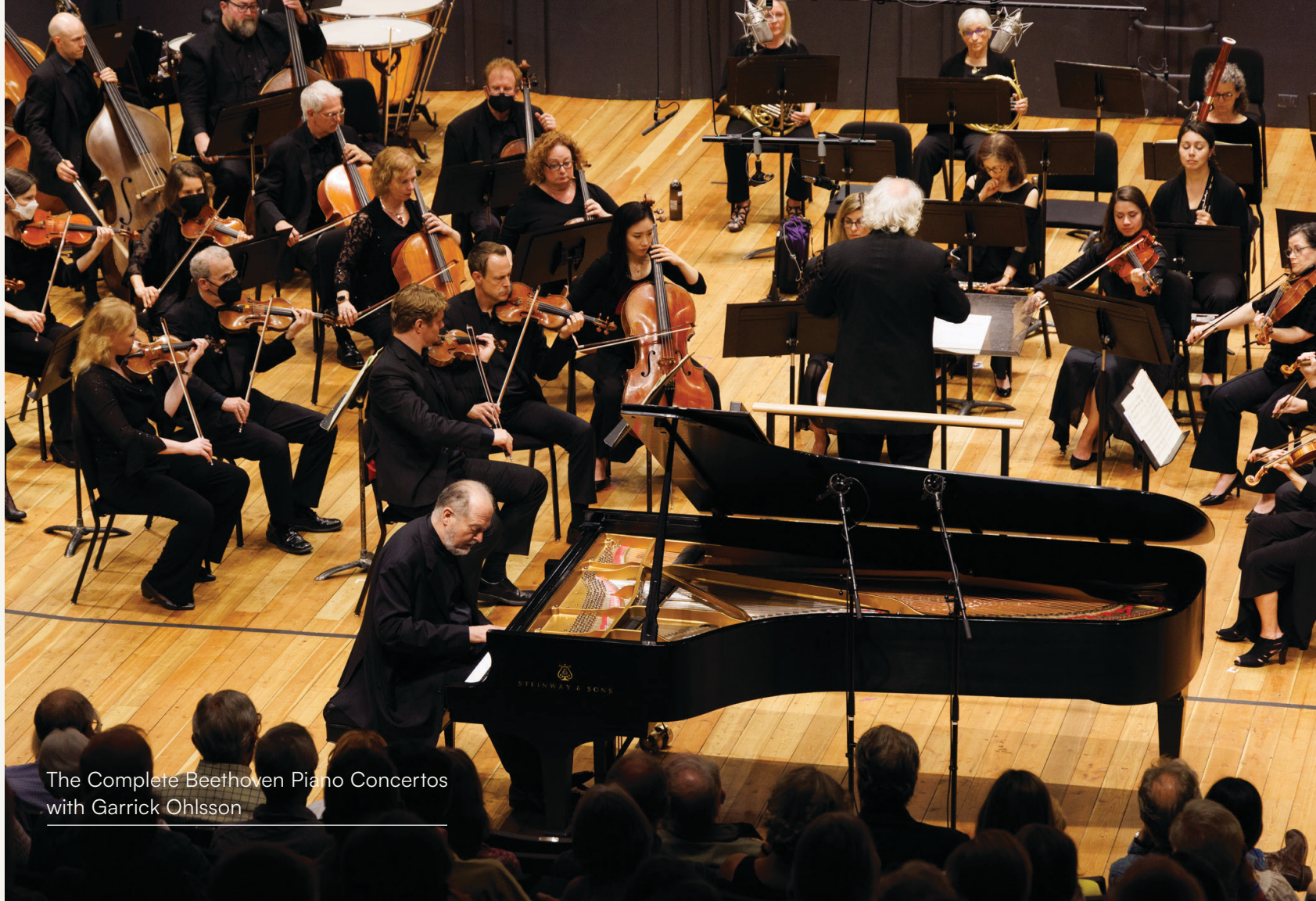
The Complete Beethoven Piano Concertos with Garrick Ohlsson