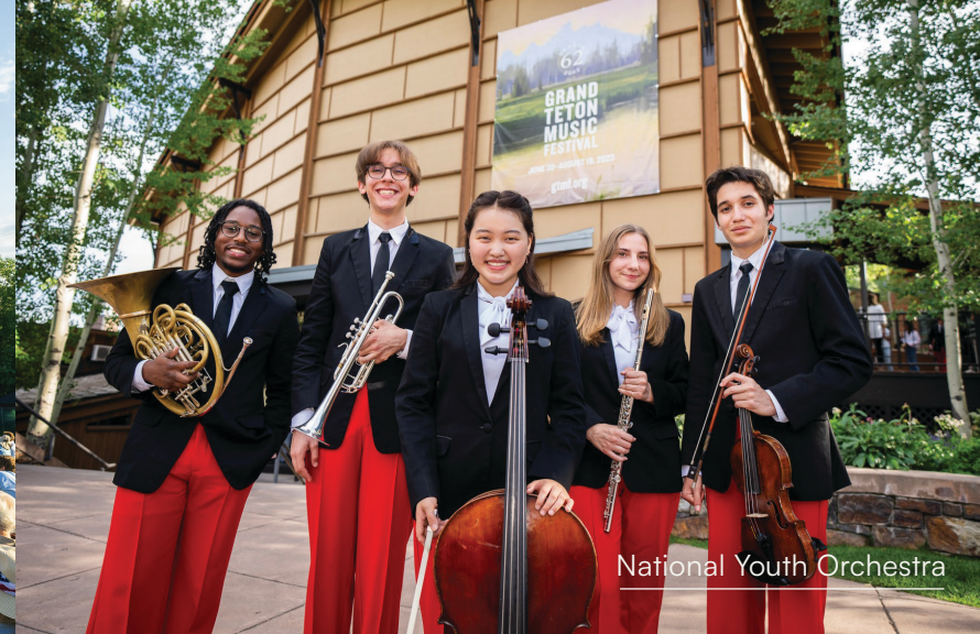
National Youth Orchestra