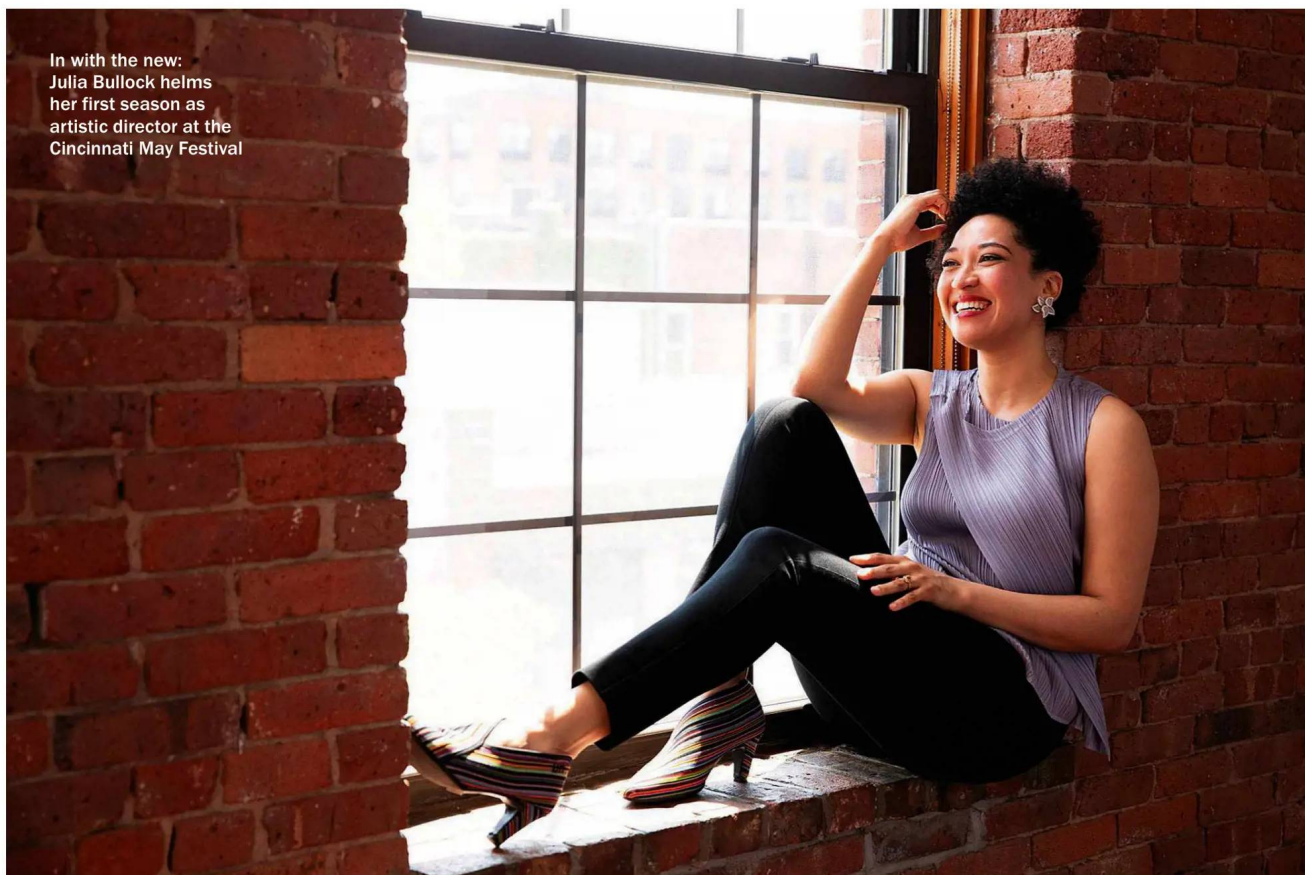
In with the new: Julia Bullock helms her first season as artistic director at the Cincinnati May Festival