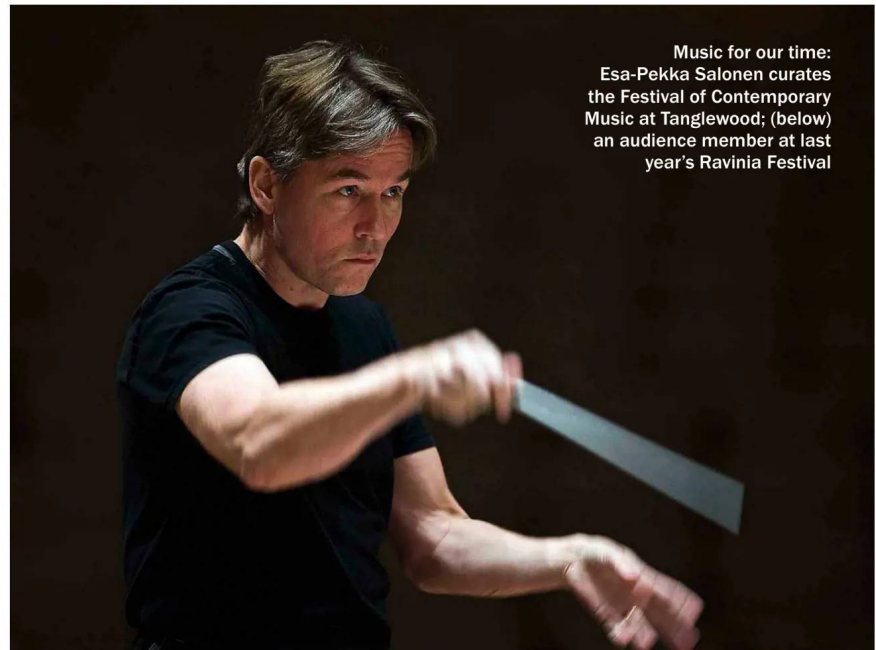
Music for our time: Esa-Pekka Salonen curates the Festival of Contemporary Music at Tanglewood; (below) an audience member at last year's Ravinia Festival

For well over 80 years, Tanglewood has positioned itself as an incomparable incubator of musical talent, and including the Koussevitzky Shed and more intimate Seiji Ozawa Hall, its story is unfolded in the names of Tanglewood's cherished meeting places. The Boston Symphony Orchestra's summer festival is writ large - from opera to chamber music,